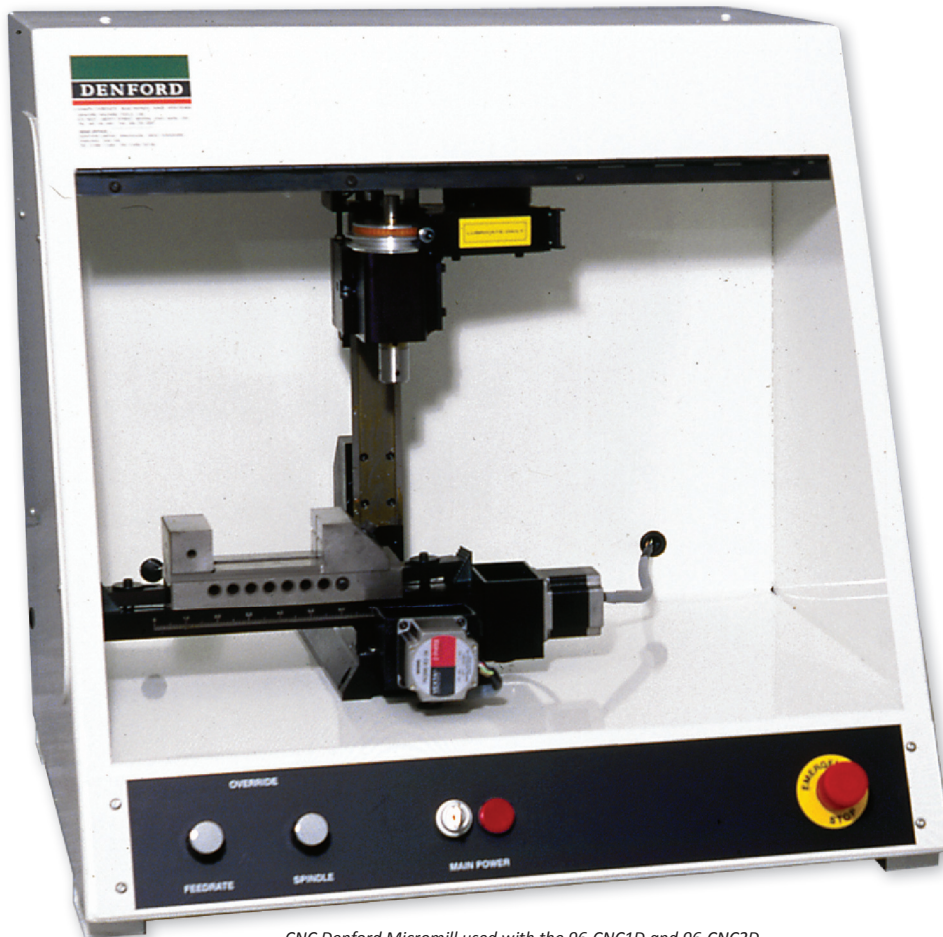
CNC Denford Micromill used with the 96-CNC1D and 96-CNC2D