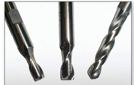
96-CNC2D Tooling Kit

Using the 96-CNC1D's Denford Micromill, CNC Machines 2 includes end mills and a stub drill bit. Learners will use these components to practice industry-applicable skills like designing CNC programs that use a pecking cycle, a boring cycle, subprograms, cutter compensation, and mirroring. Other topics discussed in this course include spindle speed, feed rate, and cycle time optimization.