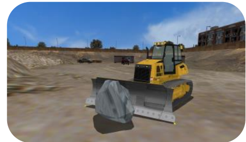
Using the blade to control the path of a boulder