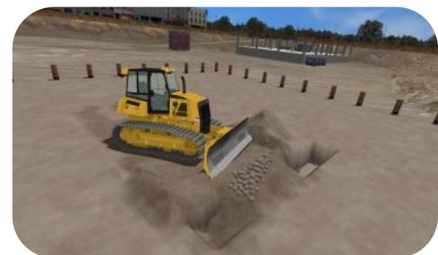
Using the blade to backfill a trench