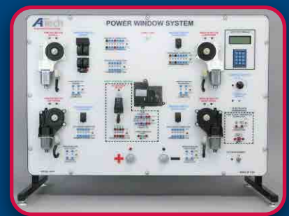
Power Window System (840C)