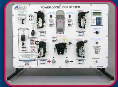
Power Door Lock System (850C)