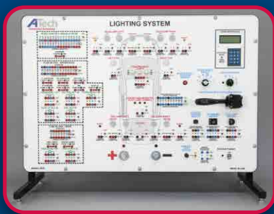
Lighting System (821C)