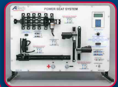
Power Seat System (860C)