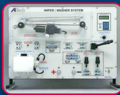
Wiper/Washer System (830C)