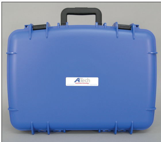
Optional Storage Case available.

The Electricity Trainer (model 1810) is a hands-on study of basic automotive electricity. The trainer features real fixed components, wire terminals, 15-Volt power supply. Fault insertion capability with optional Keypad (model 1802) or with Class Management Program (CMP) and CBI. Included is a USB drive containing the Student Manual, Instructor Guide and an on-site copy license to allow for the reproduction of instructional materials for use in the classroom.