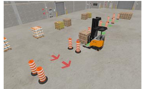
Slalom 1, for driving forwards