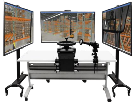
Setup with three “big screen” displays, steering wheel, and horizontal joystick