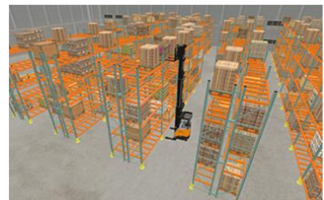
Selective Pallet Racks, narrow aisles, mixed shelves