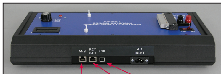
ANS (Serial Hub) • Keypad • USB