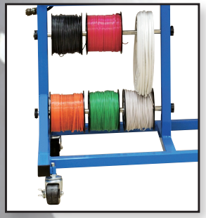
Wire Consumables Storage

This 950-SPF1 workstation has been designed to be an effective, selfcontained, and durable learning device. Installation skills are performed quickly and all-inclusive at the workstation with the use of clamp-on meter, digital meter, wire consumables storage, and vertical component installation panel.