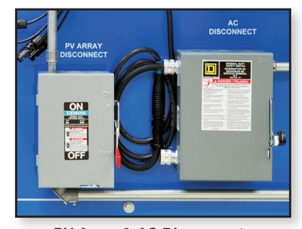
PV Array & AC Disconnects